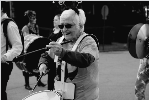
Joyful drumming to lead the way!