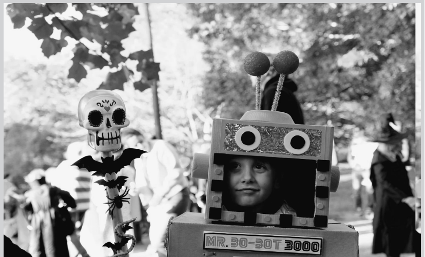
Prize-winning robot is sanguine about skeleton.