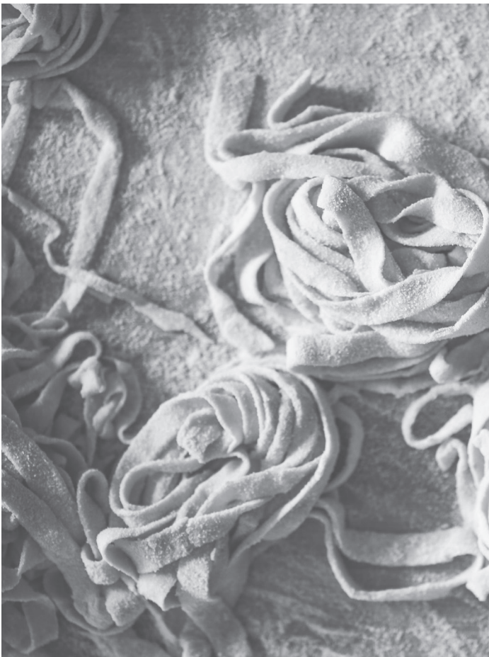
photo credit under creative commons license: https://creativecommons.org/licenses/by/2.0/ https://commons.wikimedia.org/wiki/Commons:GNU_Free_Documentation_License