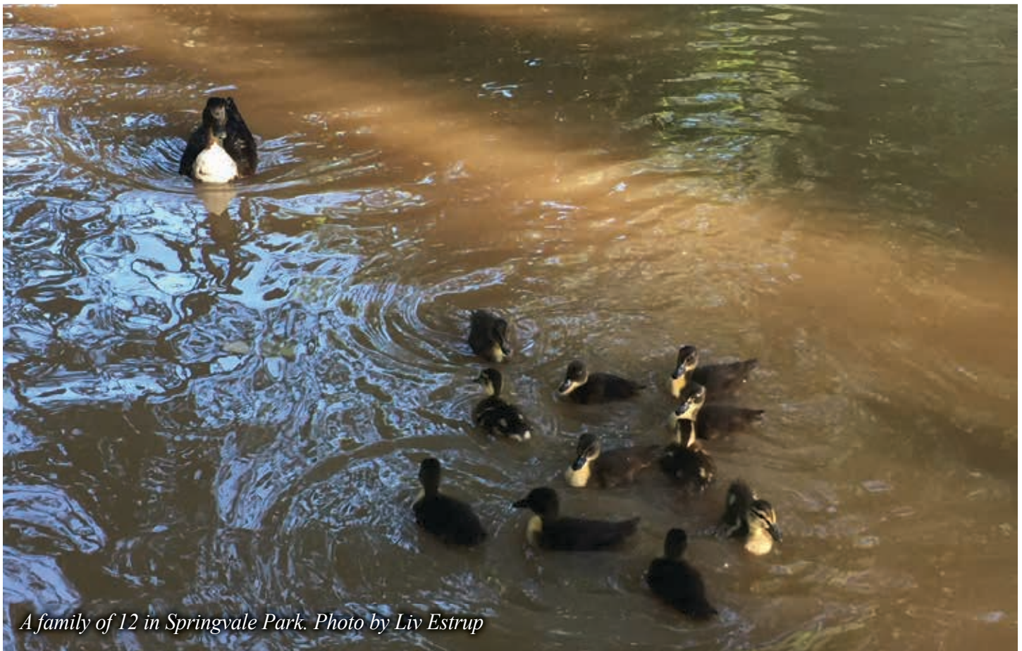
A family of 12 in Springvale Park.

For Sale in Inman Park 1084 Austin Avenue: Coming Soon!