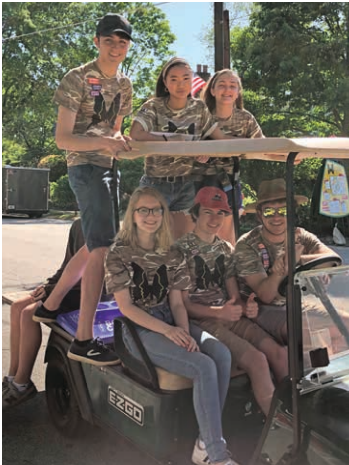
Inman Park Trash Force - Festival 2018

what better way to meet his neighbors than to be able to tell them that getting through the neighborhood process is the easy part of dealing with their city. Moreover, who doesn’t need more emails to read? So, he is back, older, hopefully with more perspective and a rested eye, ready to pore over development plans, attend meetings, and swap emails. Also, he likes reading the City’s Zoning Code. In a previous lifetime, he was an environmental chemist and the shortstop for the New York Mets. (One of these is true in this timeline, and one is true in his dreams.) He has two teenagers who think he is funny but a good source for money, and he is married to someone with a cool job managing the educational programs at the Children’s Museum. M