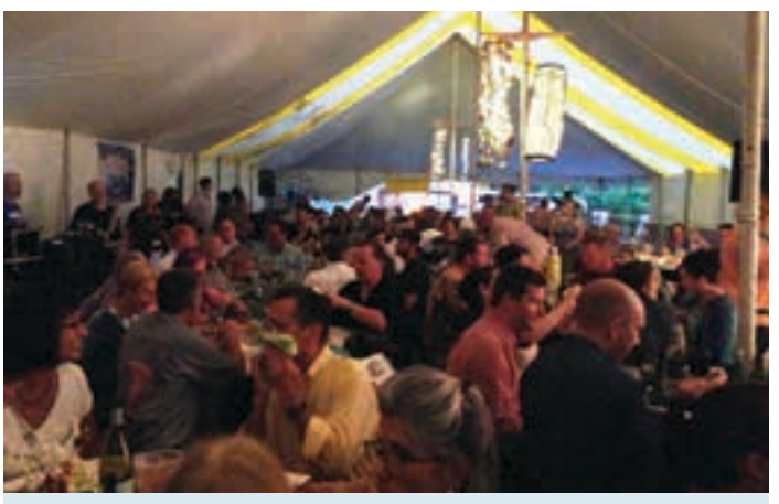
It was a packed house for Theatre Night 2016