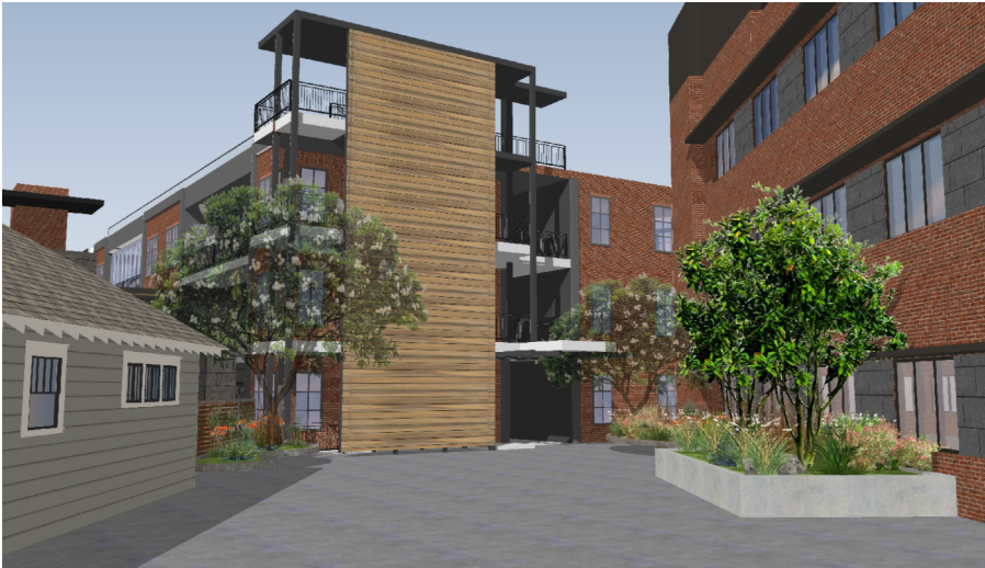
H,1 BUILDING C 3D IMAGES