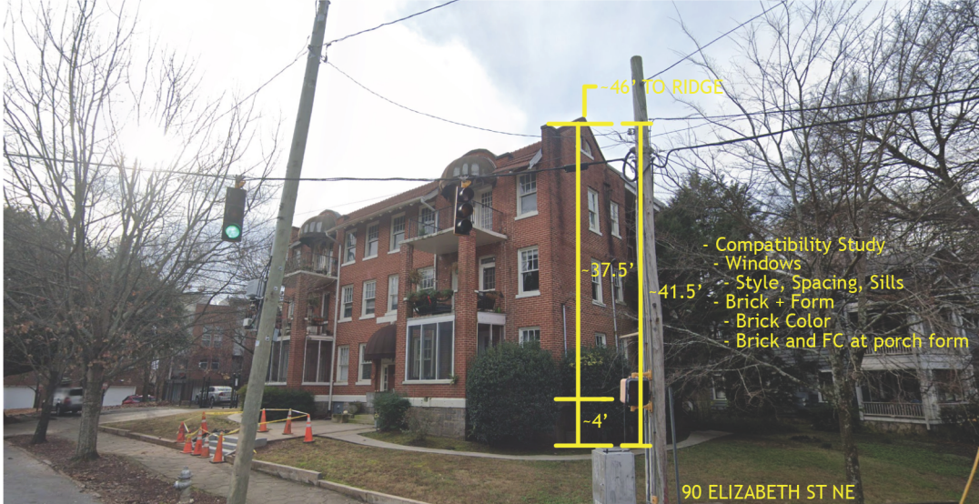
A,1 BUILDING C COMPATIBILITY