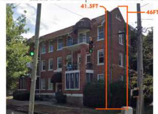
90 ELIZABETH ST (APARTMENTS, MULTI-FAMILY) - 3 STORIES - 41.5FT IN HEIGHT & 46FT TO GABLE RIDGE