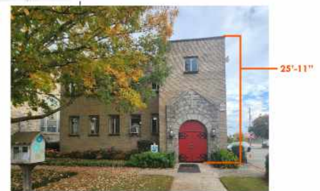
999 EDGEWOOD AVE (IPMC, MIXED-USE OFFICE/EDUCATION) - 2.5 STORIES - 25'-11" FT IN HEIGHT