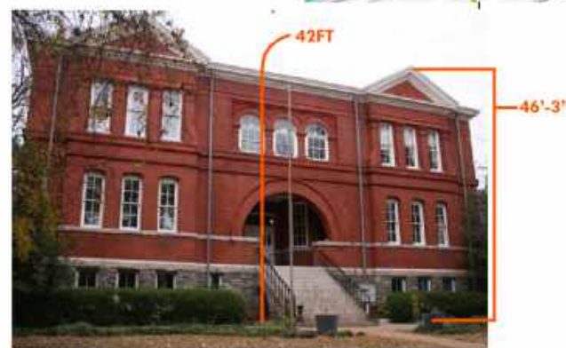
729 EDGEWOOD AVENUE NE (OLD SCHOOL, MULTI-FAMILY) - 3 STORIES - 42FT IN HEIGHT (TO GUTTER) & 48-49FT TO MAIN GABLE RIDGE