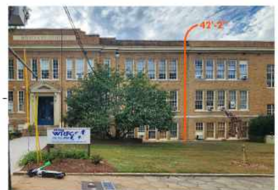
1083 AUSTIN AVE (L5PCC, MIXED-USE) - 2-3 STORIES - 42FT IN HEIGHT