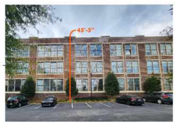
1080 EUCLID (BASS LOFTS, MULTI-FAMILY) - 3 STORIES - 45FT IN HEIGHT