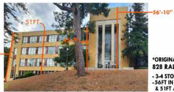
*ORIGINAL INDUSTRIAL CORRIDOR BUT NOT SA1* 828 RALPH MCGILL BLVD (TF, MIXED-USE) - 3-4 STORIES - 56FT IN HEIGHT AT ENTRY & 51FT AT AVERAGE FRONT GRADE