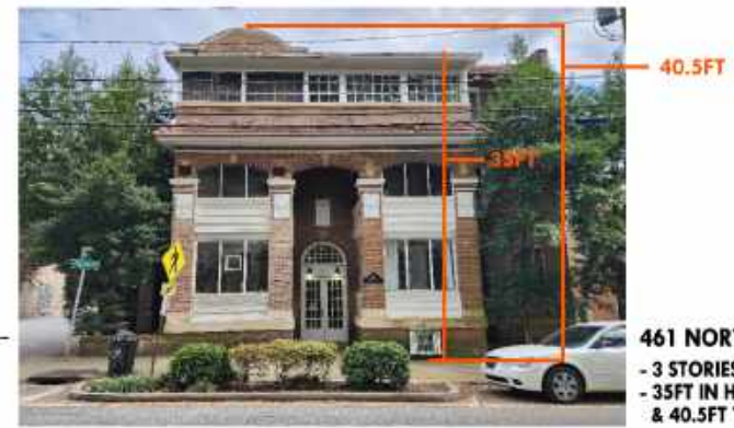
461 NORTH HIGHLAND AVE (APARTMENTS, MULTI-FAMILY) - 3 STORIES - 35FT IN HEIGHT AT CORNICE/GUTTER & 40.5FT TOP OF PARAPET